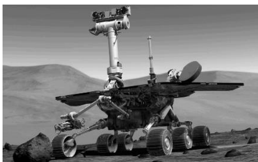
Opportunity has spent its time on Mars taking pictures and gathering information for NASA to interpret about the planet.