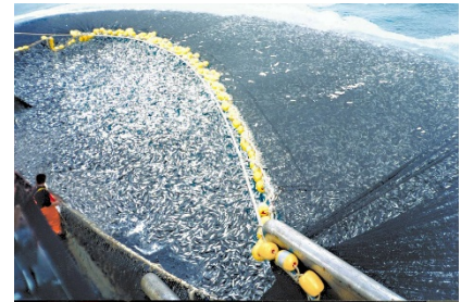
Fish net catches hordes of fishes in one go.

Whatever we do now is going to affect our way of fishing in the future.