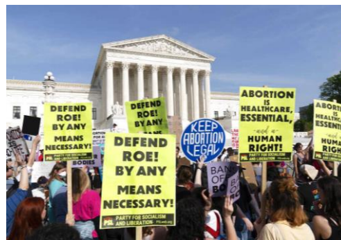
Protesters defies leaked verdict across the U.S.

If Roe v. Wade is overturned, it will leave the states to decide the legality of