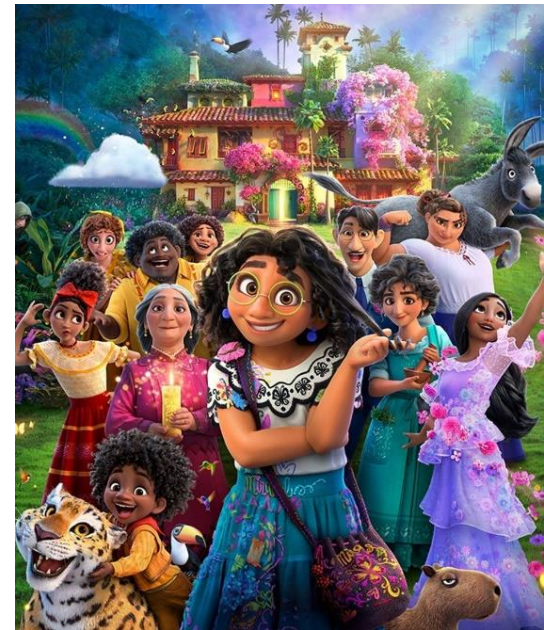
The newest Disney film, Encanto , represents people of color.

Altogether, I recommend this movie but I think Disney needs to give people of color even more representation. We still have a long way