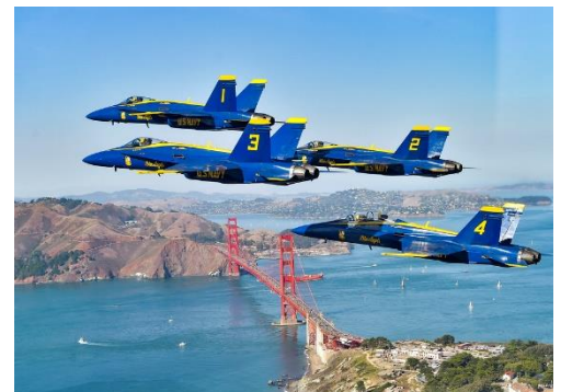
The Blue Angels continue to amaze viewers when they fly over the Bay Area annually.

According to www.history.navy.com , the team's first airplanes were four Grumman F6F Hellcats. They then started using F8F Bearcats in late 1946 and by 1949, they flew the F9F-2 Panther.