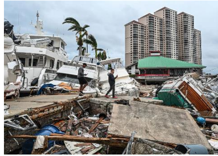
Two men survey the damage caused by Hurricane Ian. Many people have lost their homes due to Ian.

According to worldvision.org, Hurricane Ian formed over the central Caribbean Sea late on Friday, September 23, 2022, as a tropical storm.