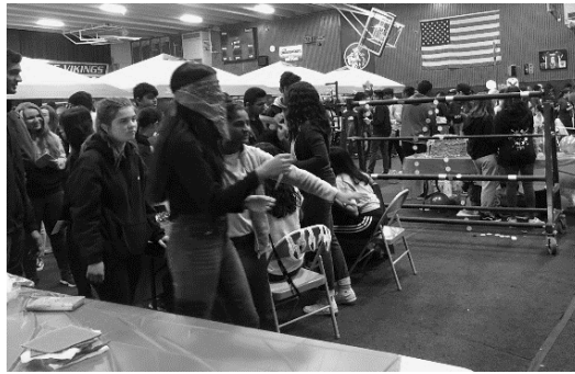
Students could go to various stations to play games, but only if they could answer a question in Spanish first.