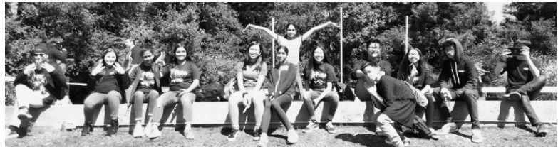
students relax on the CSU Easy Bay campus after the MESA competition.