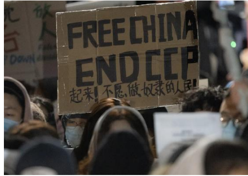
Citizens of China protest because of their dislike of the "Zero Covid" rule.

While some places aren't as strict with these restrictions other places such as China still are. With their "Zero-Covid" policy, not everyone has been happy. According to Vox.com, the policy doesn't let people leave their homes for months at a time. While this upsets citizens living in various parts of China, an apartment fire located in the city of Urumqi seemed to set off the citizens. At least