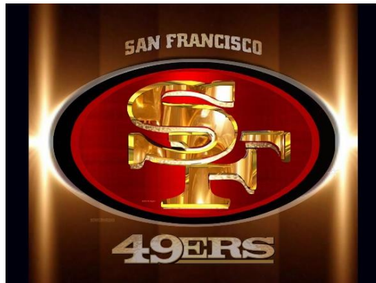
After a catastrophic loss in the semifinals 49er's fans base still has high expectations for next year.

There have been theories why the 49ers lost but according to nfl.com, during the 1st quarter of the game Brock Purdy got hit by