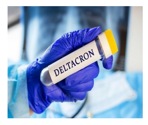
Deltacron is the latest COVID variant that is spreading rapidly across the world.

Information put forth by WebMD states Deltacron was found on the March 11 2022. In the March 10