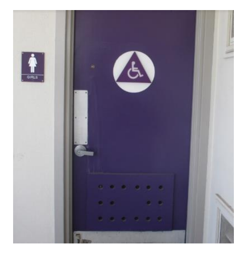
Teachers are restricting the amount of times students are allowed to use the bathroom during classes.

Another consideration for the number of restrooms at schools is the amount of students. There must be a specific number of bathrooms available for students based on the amount of students attending the school. In California, the rule is one bathroom per forty girls and one bathroom per forty boys.