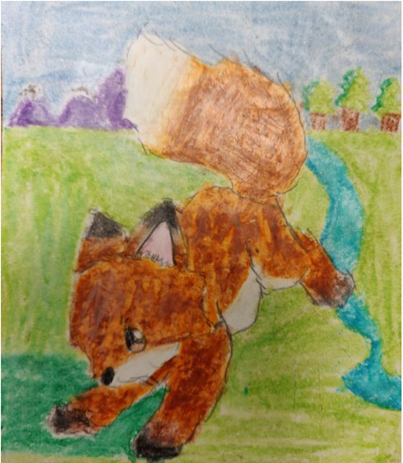
By Sammy, Rm 16